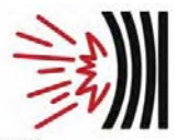
Shock absorbing bumper Shock absorbing bumper improves safety and comfort while working.