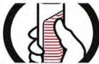
Non-slip grips Non-slip grip material ensures comfortable handling in all positions.